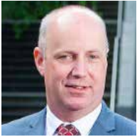
Jim Daly Minister of State, Department of Health